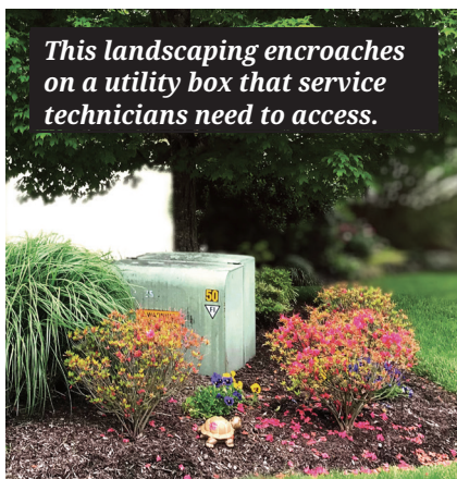
This landscaping encroaches on a utility box that service technicians need to access.

These green metal boxes convert high-voltage electrical current to a lower-voltage current for residential homes. Unobstructed access to those boxes is crucial so NOVEC technicians can safely conduct repairs when needed. To help ensure access, NOVEC does not allow trees or shrubs to be planted close to these boxes. Clear plants within five feet of each side or the rear, and 10 feet in front of a transformer.